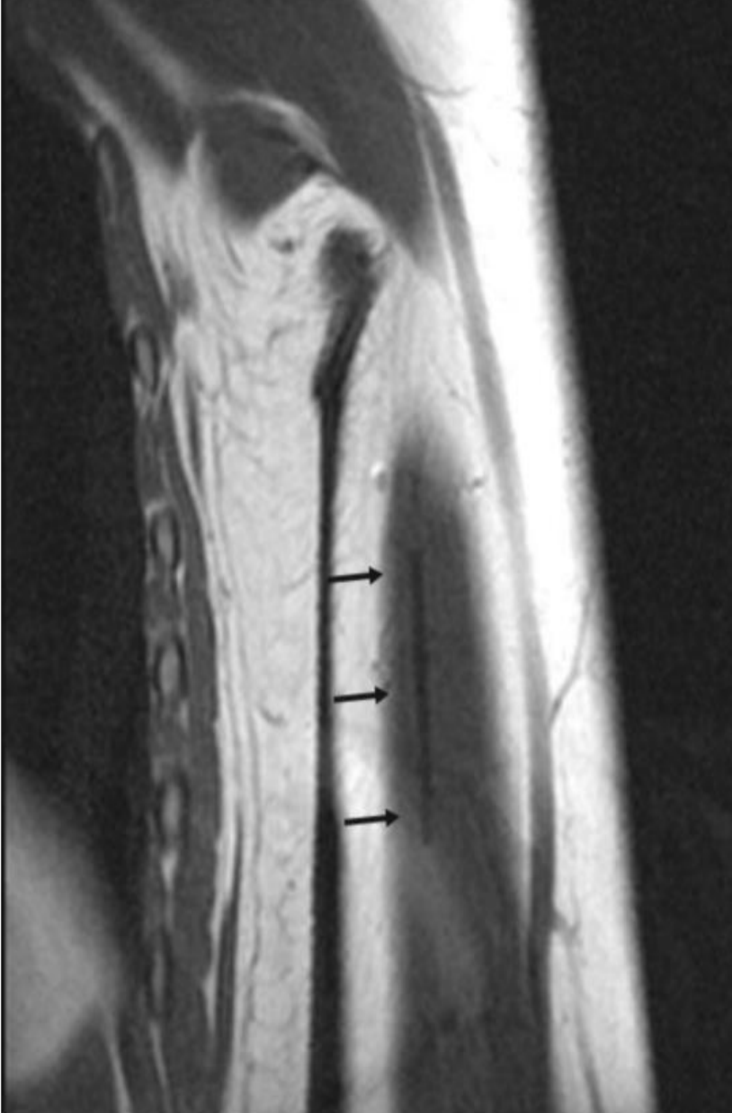
Fig. 4: MRI SET1-weighted in coronal plane shows a hypointense, well-shaped structure (arrows) measuring 4 cm. compatible with an implant rod.